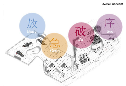
Overall concept plan