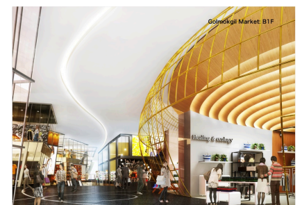
Golmokgil Mall B1F Design Concept