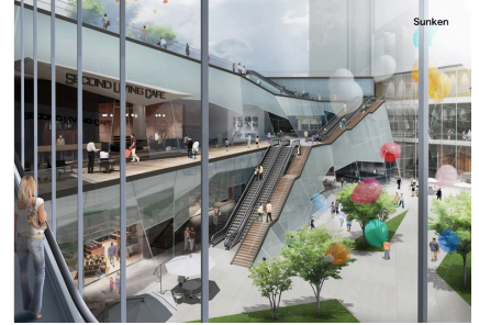
Sunken Design Concept