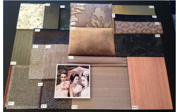
Materials mood board.