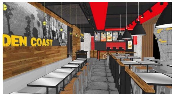
Store design concept.