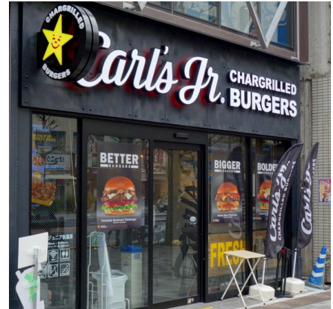
As Built store exterior.